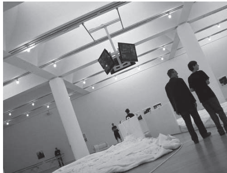
Fig. 1 – Matthew Barney, Drawing Restraint 9: Dejima , 2005. Three-channel color digital video with stereo sound (12:20). Installation View: San Francisco Museum of Modern Art, 2006

Matthew Barney’s artistic activities are an exemplary case of enunciative construction underpinning the ways “cinema” is present in the installation. His “practice” – which was the subject of a case study – 7 has been chosen in this context for the complexity of the issues (also ideological) that it poses (and resolves), also because it concerns the root of the mutation in statute of the concept of “work.” Such as the DRAWING RESTRAINT (began in 1986 and in fieri ). This project included the presentation, in different exhibition contexts, of the constellation of works that formed through Drawing Restraint 9 (2005-2006, film also presented at the Mostra Internazionale d’Arte Cinematografica di Venezia and the Berlinale in 2006), amongst which Dejima (2005, complex multi-channel video-installation). As with all the other works in the constellation, Dejima not only places us in the peculiar experiential journey of the work but it also reflects the dynamics of the DRAWING RESTRAINT project as a whole. In one of the exhibition variations of Dejima (fig. 1) the screens are suspended on a large scale sculpture Cetacea (2005/2010, [fig. 2]) that defines the multi-level principle of the narration in the film Drawing Restraint 9 (fig. 3).