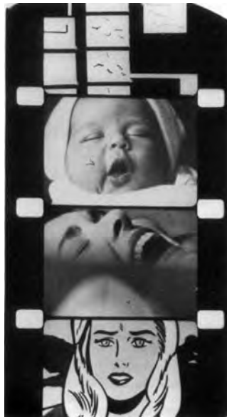
Fig. 4 – Recreation (Robert Breer, 1956-57).

In 1958, Len Lye won first prize at the Knooke-le-Zoute festival with Free Radicals , a four-minute film completely scratched on black leader with a needle. It was made almost as a manifesto, since Lye couldn't raise any money from sponsors for filmmaking. So, he scratched the film with a needle, spending very little besides time, and then went on strike as a filmmaker for the rest of his life, switching to sculpture where he could make a living. (He scratched four films in secret over the next twenty years). Also in Knokke-le-Zoute was Recreation (1956-57, texts by Noël Burch, 1 min.) by Robert Breer, a filmmaker who lived in Paris at the time and who was interested in trying to make collisions between single frames. Most of the film's images last one frame each, 1/24 th of a second (Fig. 4). Breer was interested how the eye perceives the rapid-fire succession of disparate stills.