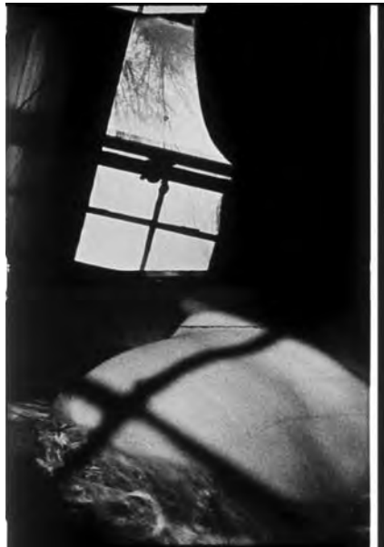
Fig. 5 – Window Water Baby Moving (Stan Brakhage, 1959).

Still in 1958, another revolutionary filmmaker, Stan Brakhage, premiered Anticipation of the Night at the same Knokke-le-Zoute festival. It is a poetic lyrical film, silent and 38-minutes long. This screening was a first introduction to Brakhage for many and a revelation. He was making films very much about his own life, like Window Water Baby Moving (1959), documenting the birth of his first child. The composition of lines and forms are as strong as the events pictured (Fig. 5). Later his work would become abstract in an attempt to represent "closed-eye" or "untutored" vision, as he called it, fast poems of light and color.