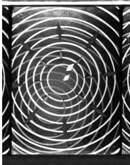
Fig. 3 – Allegretto (Oskar Fischinger, 1937).

commercials came on they were like fireworks. People loved them, and these were big audiences. This is something that doesn't happen often to experimental filmmakers these days.